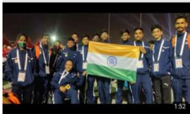
Asian Youth Para Games 2021#Opening Ceremony: #Indian Fl... SportsStudio · 171 views · 17 hours ago