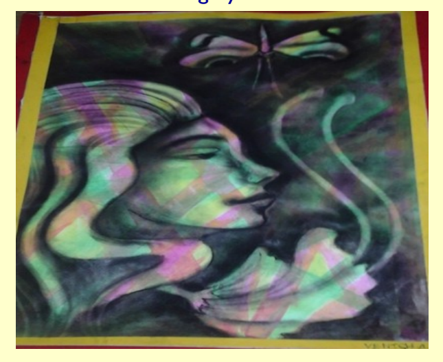
Glass Effect by Venisha Patel-V