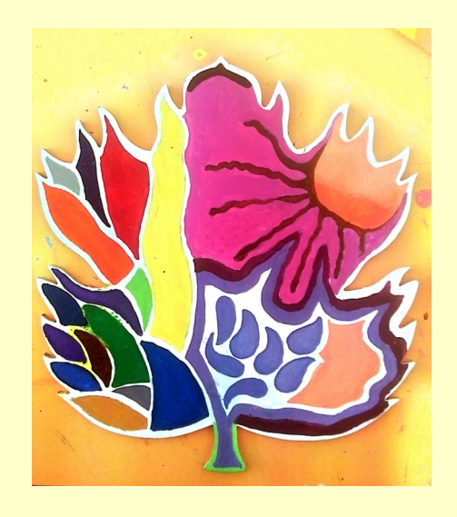
Board Painting by Sia Shah-V